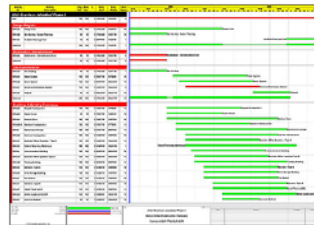
TEAHAN LTD CAN PREPARE OR REVIEW SCHEDULES

Baseline schedules and monthly schedule updates are often contract requirements. Teahan Ltd can provide schedule development and monthly updates for contractors to meet those contract requirements.