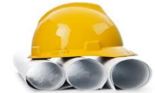
DISPUTES ARE FREQUENT. TEAHAN LTD CAN HELP